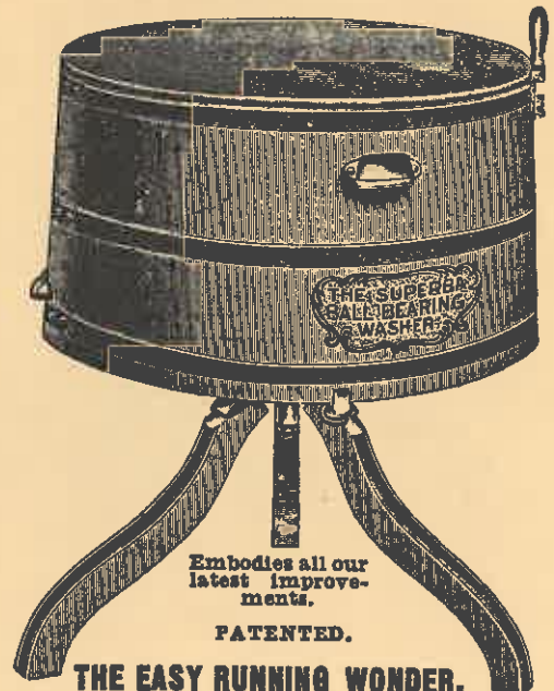
Embodies all our latest improvements. PATENTED. THE EASY RUNNING WONDER.

Made of poultry netting and are positively the best nests that money can buy. They are favored by poultry raisers everywhere. Can be fastened to the wall with two nails or screws, and are made so that eggs cannot drop out. Should be lined with hay or straw and supported at bottom. Size is outside diameter of nest. Sold only in dozen lots.