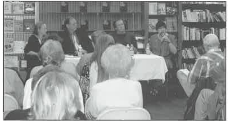
Attendees enjoy November's presentation of History Makers