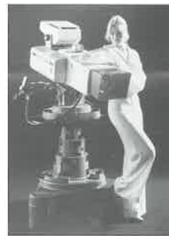
Model with Ampex Camera, ca. 1970