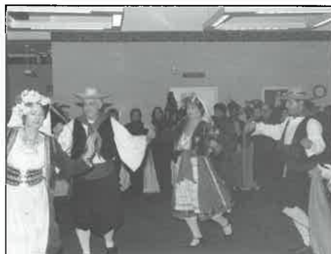
The Hellenic Heritage Institute provided entertainment at HSJ's holiday party with traditional Greek dancing.

Located in the Deluz House in History Park, HHI exhibits will include a permanent display of artifacts, memorabilia and heirlooms depicting traditional Greek homes. The exhibit is scheduled to open to the public in April.