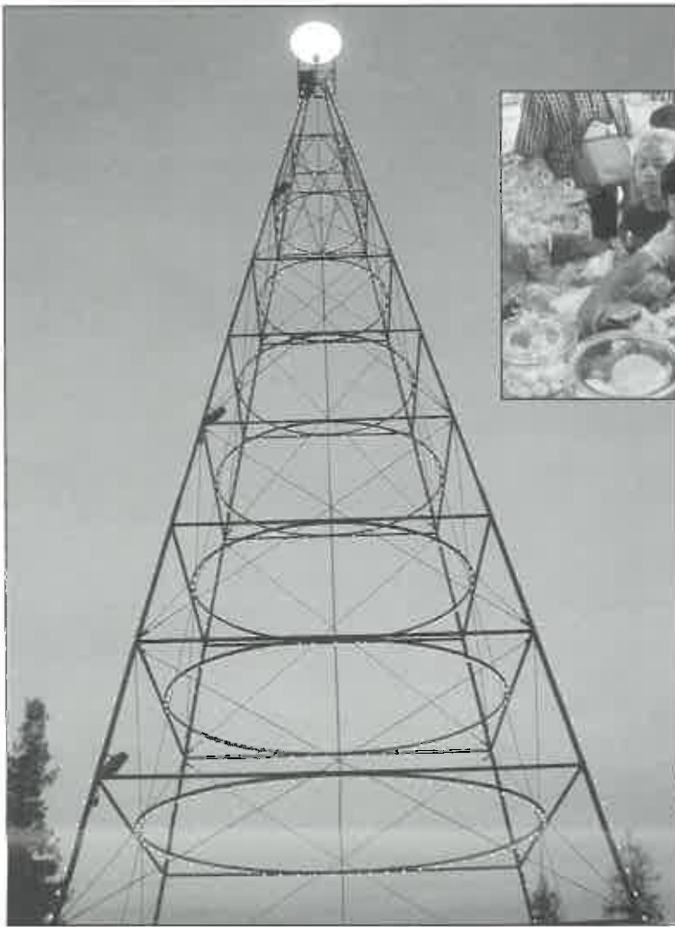
After four years, the light tower comes alive again.