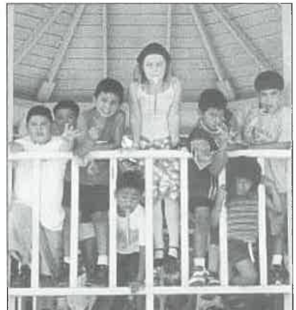
Camp Fire's summer fun.

History Park hosted a low-cost day camp between June and August 2001 for Camp Fire Boys and Girls. This nine-week activity had the county-wide advantages of being lower-than-average cost, longer-than-average daily hours (7 a.m.–6 p.m.), and was available on a week-by-week as-needed basis. Professional and trained volunteer counselors led 7–11 year-olds in themed activities, outdoor exercises, and reading skills.