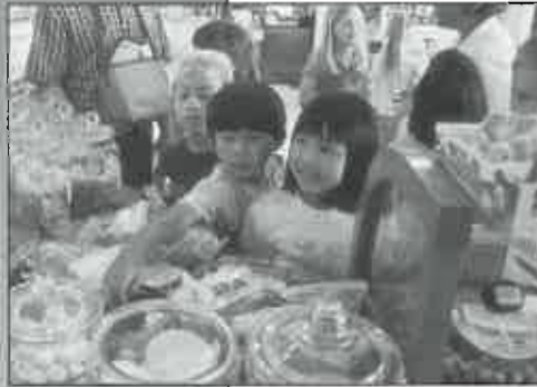
Happy faces at O'Brien's.