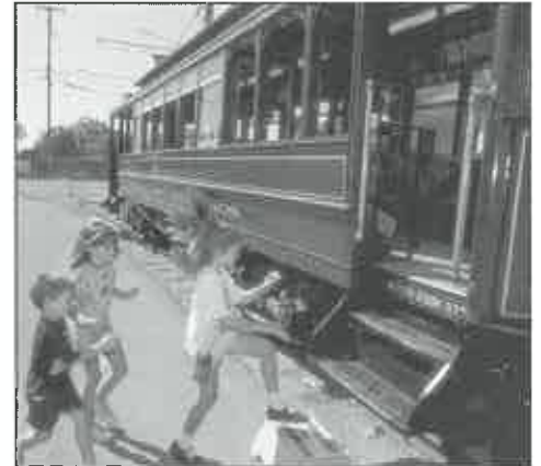
Trolley rides at History Park.