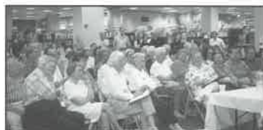
Audience at Barnes & Noble.