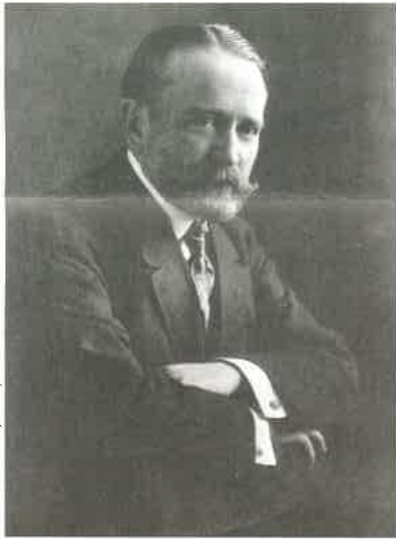
Senator James D. Phelan.

Through the efforts of the Montalvo Association, the estate has risen to become a major center for the arts.