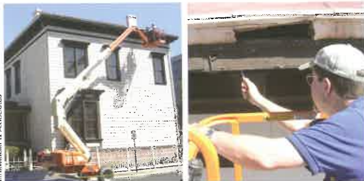
Mineweaser & Associates inspecting the Fallon House.