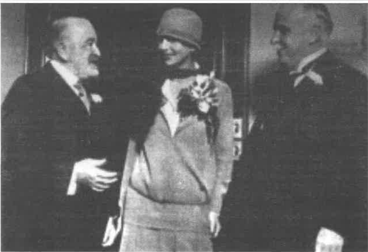
James Duval Phelan (shown here with Helen Wills and James "Sunny Jim" Rolph) was never at a loss for proper and engaging words, no matter the occasion or the circumstances.