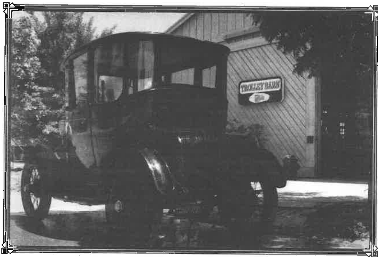
Top right photos: HMSJ volunteer Allan Greenburg takes time to spruce up the old beauty. Bottom photo: Clean, shiny and ready to roll.