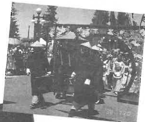
Both photos: 1998 Festival Parade