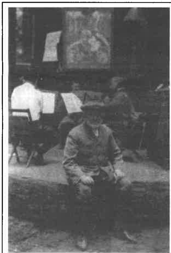
Phelan shared traditional views on the subject of marriage. For ordinary persons the demands of domesticity were arduous enough. For artists they could be overwhelming.

Years later Wills confided to a friend about her relationship with the Senator: I only wish that our lives had more nearly coincided—that I had been born earlier or he later ... this is one of the unfortunate things in life—that a few years make such a difference, and so much sorrow.