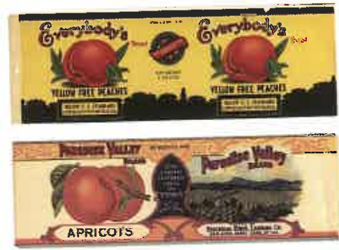
Labels printed by the Muirson Label Company; the top label bears the description "Below U.S. Standard. Low Quality But Not Illegal."

From 1914 to 1970 the Muirson Label Company of San José served a thriving fruit production industry that included orchards, canneries, can manufacturers and canning equipment companies. Muirson printed labels—beautiful works of art in their own right—for almost every canner and fruit grower in the Valley of Heart's Delight. Today on the site of the company's plant stands Cinnabar Commons, an affordable housing complex and park, but the story of Muirson lives on through a new online exhibit titled Label Legacy: The Muirson Label Company at www.historysanjose.org . HSJ wishes to thank our Label Legacy sponsor Cinnabar Commons, LP for funding this innovative project.