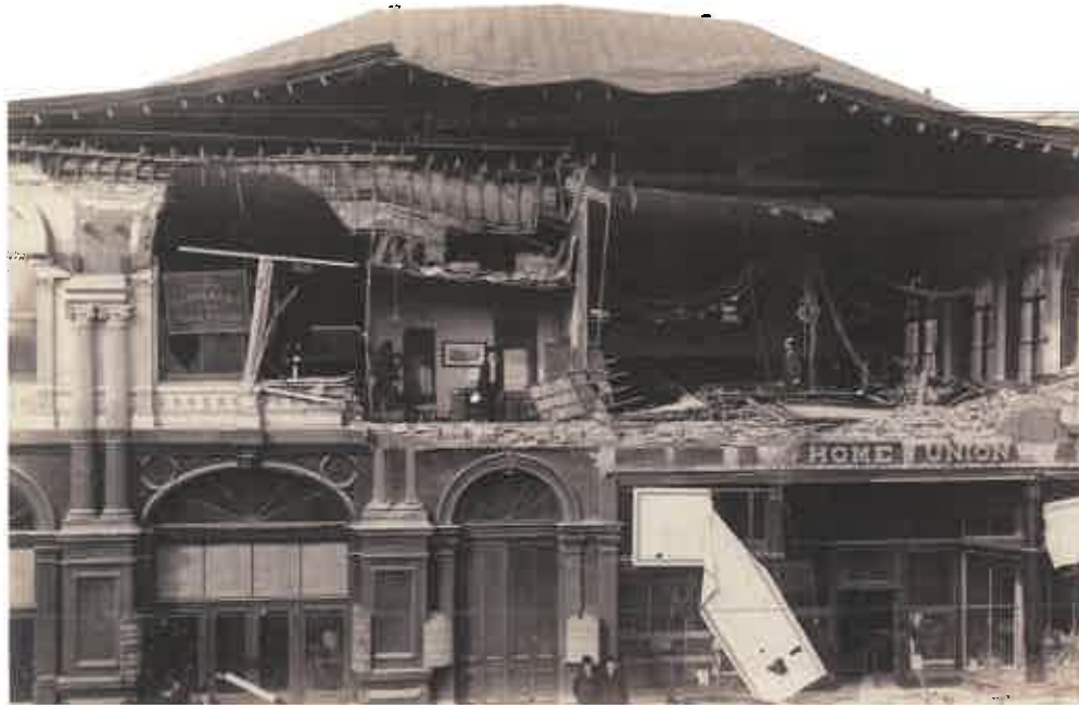
Garden City Implement Company & Home Union Building, 61 South Market Street, San José, 1906.

When they retired to bed on the evening of April 17, 1906, the residents of San José could never have imagined how their world would be changed on the following day. Alas, some of them would not see another sunrise.