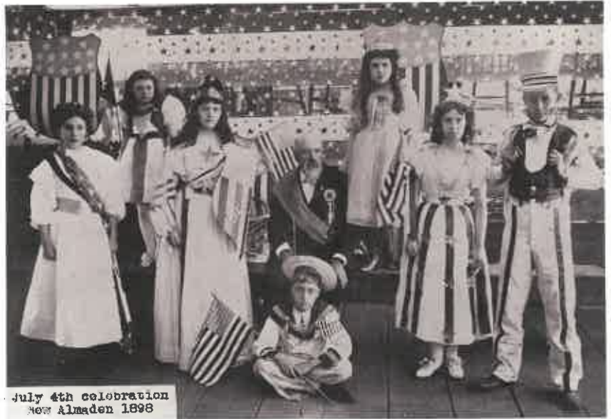
July 4th Celebration at New Almaden, 1898.

We'll cap off the evening by watching the fireworks after the San José Giants Baseball game, which are set off just across the street. It's the kind of evening you may remember from your childhood, and a great way to build your own children's memories of idyllic summer nights spent with family and friends.