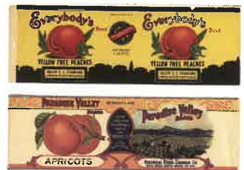
Labels printed by the Muirson Label Company; the top label bears the description "Below U.S. Standard. Low Quality But Not Illegal."

From 1914 to 1970 the Muirson Label Company of San José served a thriving fruit production industry that included orchards, canneries, can manufacturers and canning equipment companies. Muirson printed labels—beautiful works of art in their own right—for almost every canner and fruit grower in the Valley of Heart's Delight. Today on the site of the company's plant stands Cinnabar Commons, an affordable housing complex and park, but the story of Muirson lives on through a new online exhibit titled Label Legacy: The Muirson Label Company at www.historysanjose.org . HSJ wishes to thank our Label Legacy sponsor Cinnabar Commons, LP for funding this innovative project.